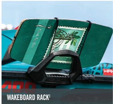
WAKEBOARD RACK 1