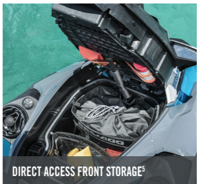
DIRECT ACCESS FRONT STORAGE 5