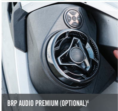
BRP AUDIO PREMIUM (OPTIONAL) 4