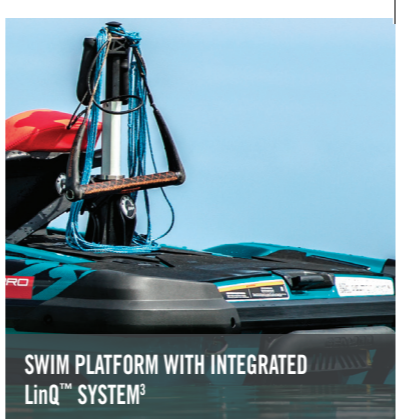
SWIM PLATFORM WITH INTEGRATED LinQ™ SYSTEM 3

Type ST 3 • Longer and larger platform • Rough water and offshore inspired deep-V hull • Stable and predictable