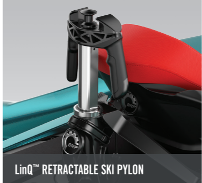
LinQ™ RETRACTABLE SKI PYLON